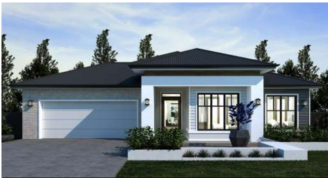
BROOKLYN MODERN HAMPTON - $