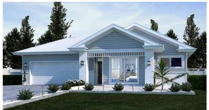
BROOKLYN HAMPTON - $