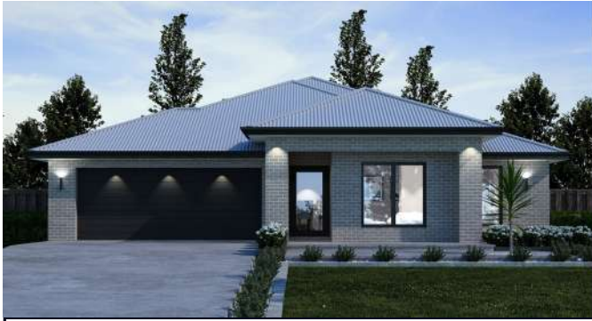
BROOKLYN DESIGNER - NO CHARGE