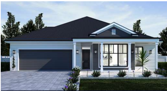
BROOKLYN COUNTRY - $