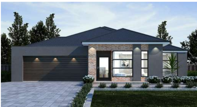
BROOKLYN MODERN - $