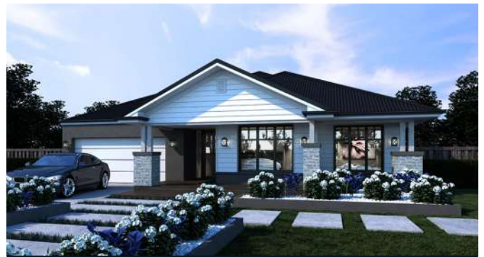
BROOKLYN HAMPTON 02 - $