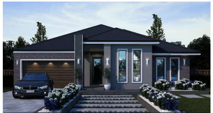
BROOKLYN MODERN 02 - $

DESIGN YOUR CUSTOM FACADE OR APPLY ANOTHER FACADE CONTACT OUR TEAM FOR PRICING