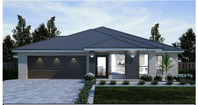
BROOKLYN CLASSIC - NO CHARGE